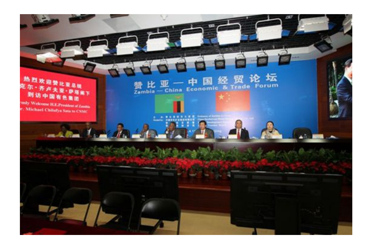
A panorama of the rostrum of the Forum

President Sata witnesses the signing of investment program agreements between the Zambia-China Economic and Trade Cooperation Zone and the 12 enterprises.