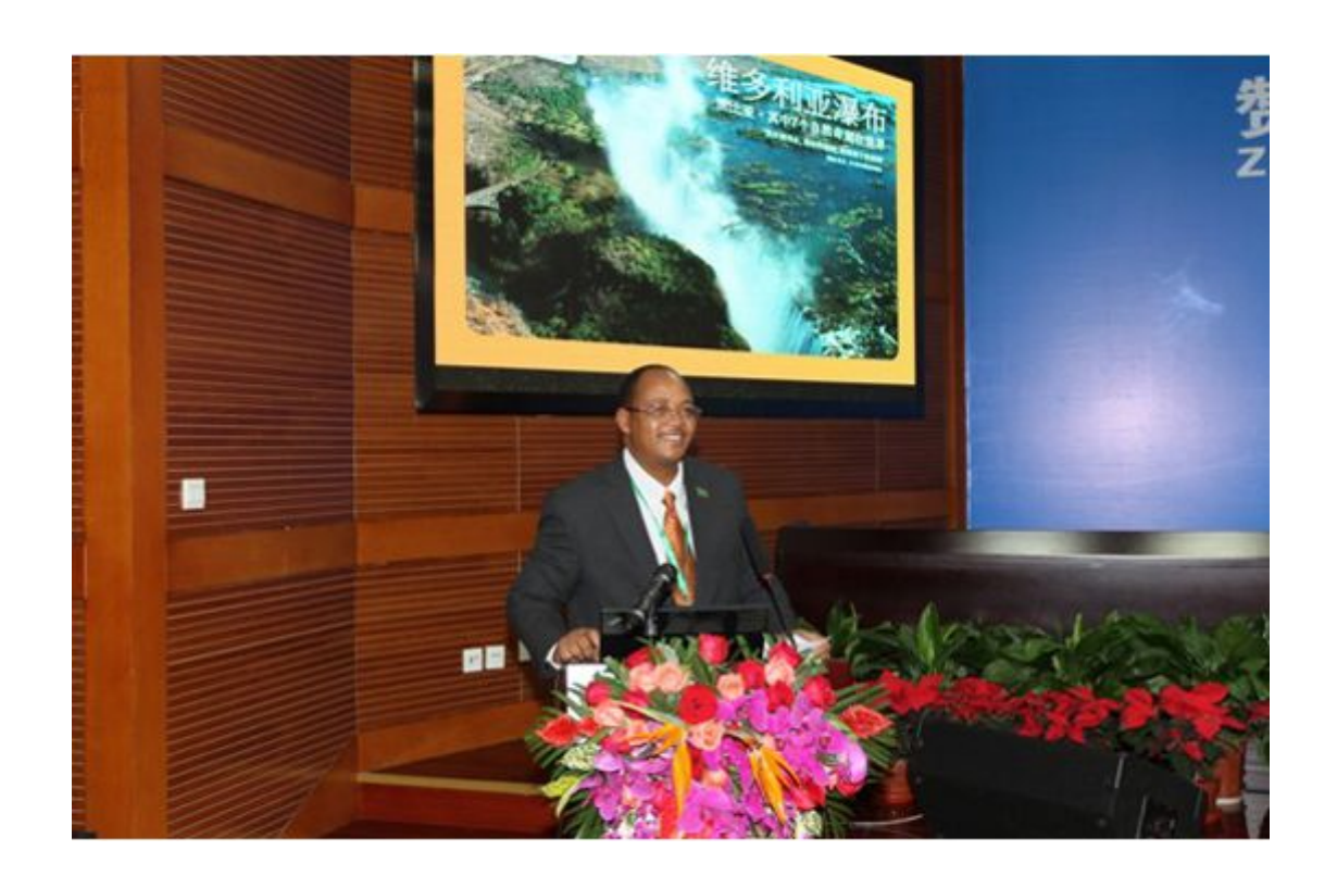
Tourism Administration of Zambia makes presentation.

Ministry of Lands, Energy and Water Development of Zambia makes presentation of investment programs.