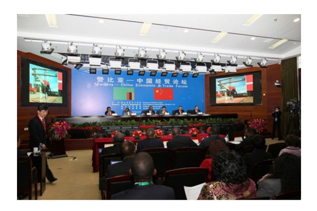
Scene of the Forum