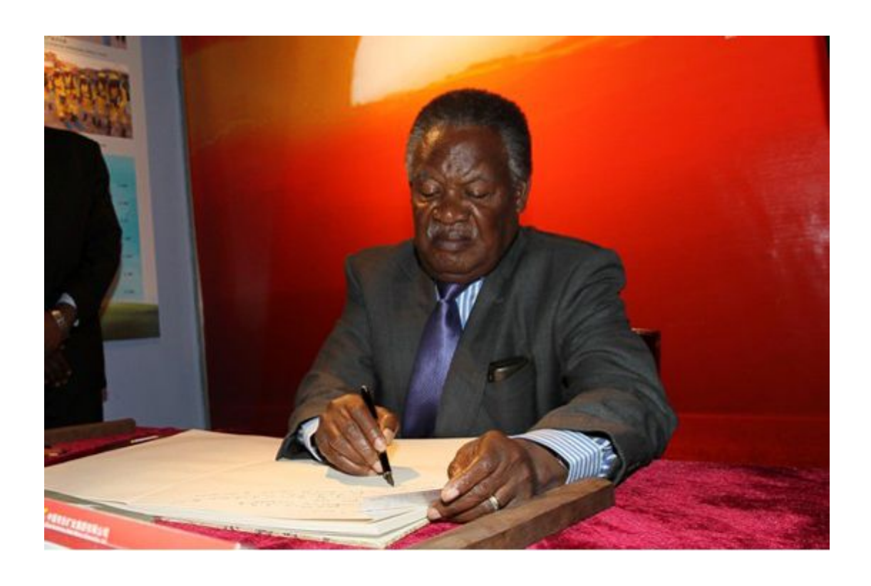
President Sata gladly writes inscription for CNMC.