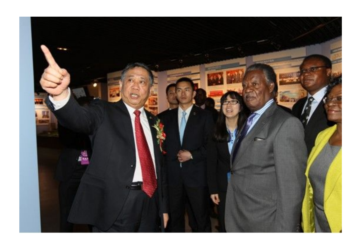
President Sata visits the CNMC exhibition hall with great interests.